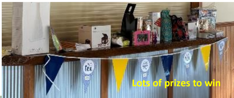
Lots of prizes to win