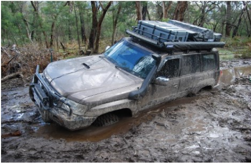
On-Board Recovery Equipment