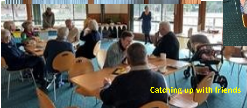
Catching up with friends