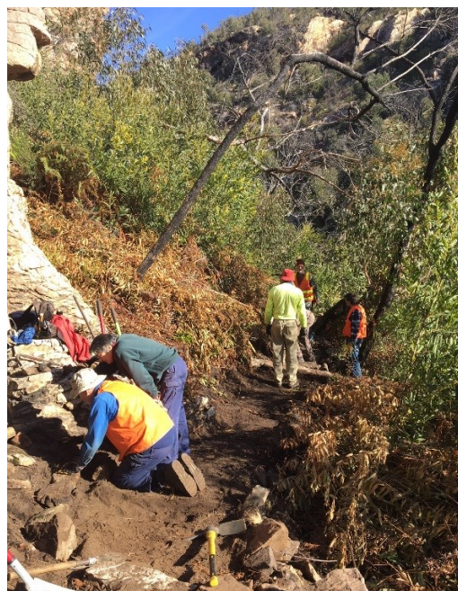
Golton Gorge redevelopment