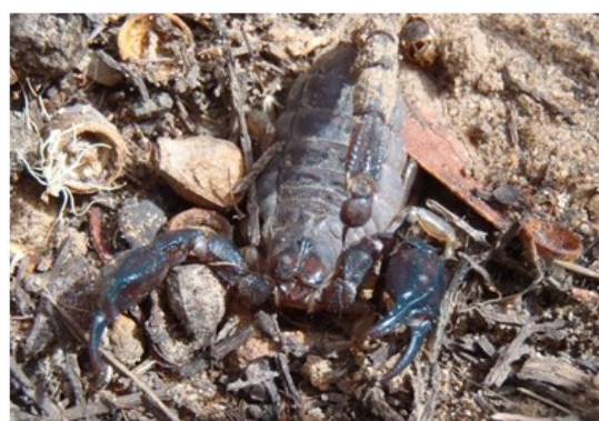
And dodging these beautiful creatures....!!