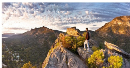
The heart of the Grampians