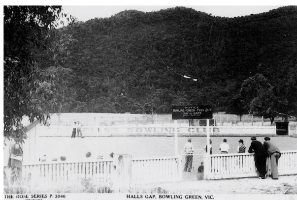
THE ROSE SERIES P. 3046

The maximum wind gust of 91 km/h was recorded on the 26th of April.