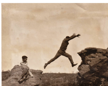
The Old Nerve Test Wonderland Range

The scene set off in such picturesque surroundings was one long to be remembered. On New Year's Day the Hall's Gap Progress Association's annual sports meeting was held and there was a very large attendance to witness the various athletic events. Wood chopping contests etc. A dance was held in the public hall in the evening. At Hotel Bellfield a fancy dress ball was held on New Year's Eve and was a most delightful function.