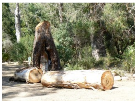
Job done! January 28 2018

However all of these projects require money, and currently almost all our funds come from the profits from the Wildflower Show and the donations box in the garden, plus one off grants. We are sure that many in the community welcome what we do but are unable to come to our working bees.