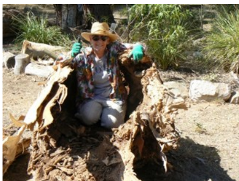
Inside the monster tree.