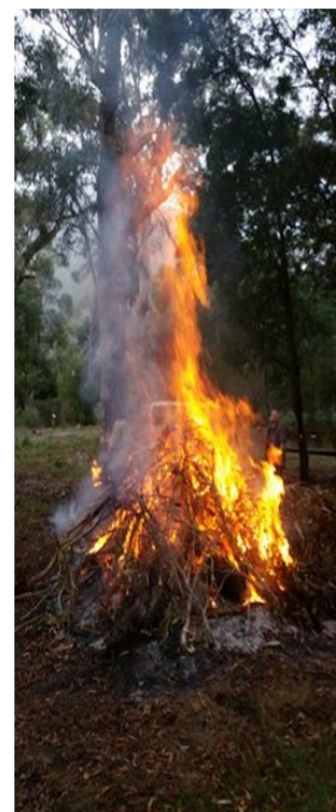
;Left: Hard at it cleaning up.