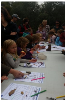
Parks Victoria and VNPA Nature Play week activity - Bush treasure Hunt.

In addition there was a table with bones, skulls, traps etc, plus an area for colouring in and creating with playdoh. Daryl ran a session on radio collar racking where the children had to locate collars in trees and Ranger Matt! It was a fun activity that highlighted the importance of protecting the treasures of the Grampians National Park. Well done Tammy, Matt and Daryl. Let's hope you can do it again. The children had such fun and both they and their parents learnt a great deal.