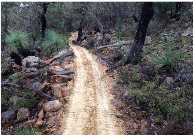
Piccaninny Walking track upgrades