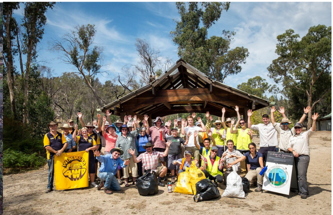
Community Celebrating Clean Up Australia Day