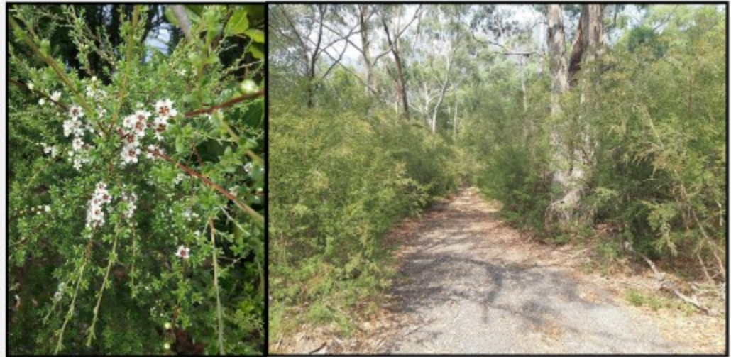
Yarra Burgan ( Kunzea leptospermoides ) (left) dominating house blocks along Scott road, Halls Gap (right)

seen along Silver Springs Road. If you think you have Burgan on your property and wish to investigate control measures, you may call Graham Parkes 0429 839179 or Project Platypus on 53584410.