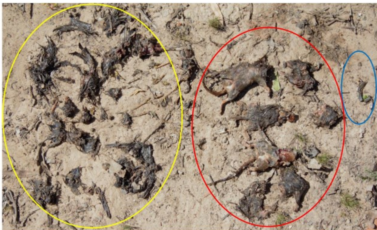
Figure 1: Stomach contents of one cat. Skink is in the blue circle, antechinus' in the red circle and birds in the yellow circle.

Our trapping efforts are targeted around areas of high conservation value where we hope to directly increase the probability of survival for the 5 priority species of the Grampians Ark; that is the Heath mouse, Smoky Mouse, Long Nosed Potoroo, Brush-tailed Rock Wallaby and the Southern Brown Bandicoot. All of which can be predated by foxes and cats, and all of which are listed at a State (FFG Act) and Federal (EPBC Act) level. See below image of stomach contents. (Content warning!)