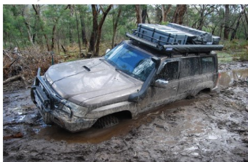
On-Board Recovery Equipment

Winches – Front and Rear Snatch Straps Winch Extension Straps Snatch Blocks Shovel Air Compressor UHF Radio Ch 20 Fridge