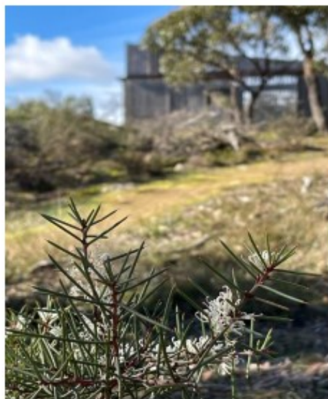
Hakea sericea (Silky Hakea) in flower at Djardji-djawara Hike-in campground (July 2023)