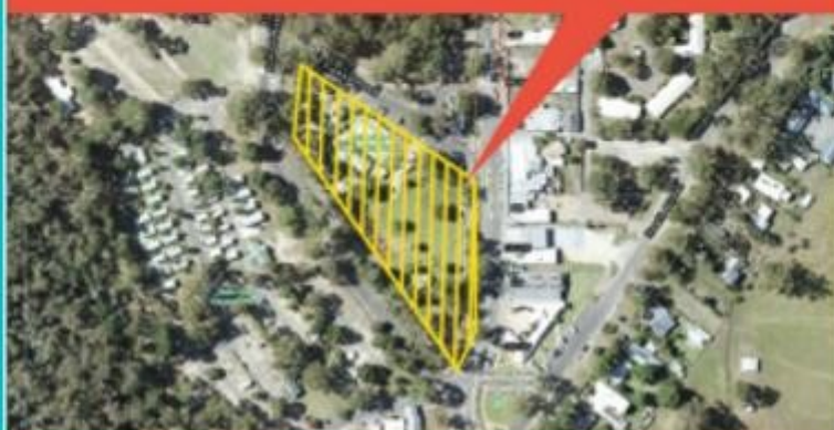
Designated Bushfire Place of Last Resort area

The new site is located at the Halls Gap Picnic Reserve, Grampians Rd. Council received approval to designate the new site from both the landowner Department of Energy, Environment & Climate Action (DEECA) and land manager Halls Gap Caravan Park & Recreation Reserve Committee of Management. You will see new signage at the site soon.