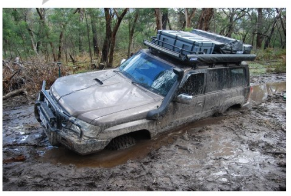
On-Board Recovery Equipment

Or 0424 619 355...Leave a message if no answer. Take a photo of this flyer.